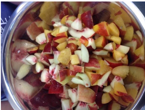
This is stone fruit with rose water fruit.